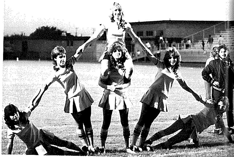
Demonstrating their spirit at a football game are the Junior high cheerleaders.